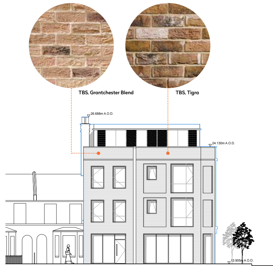
Proposed East Elevation (Haydons Road)